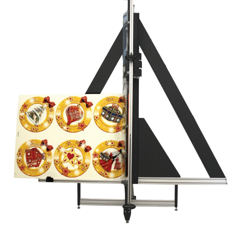
ff The max versatility for a world of graphic applications on both rigid and flexible.