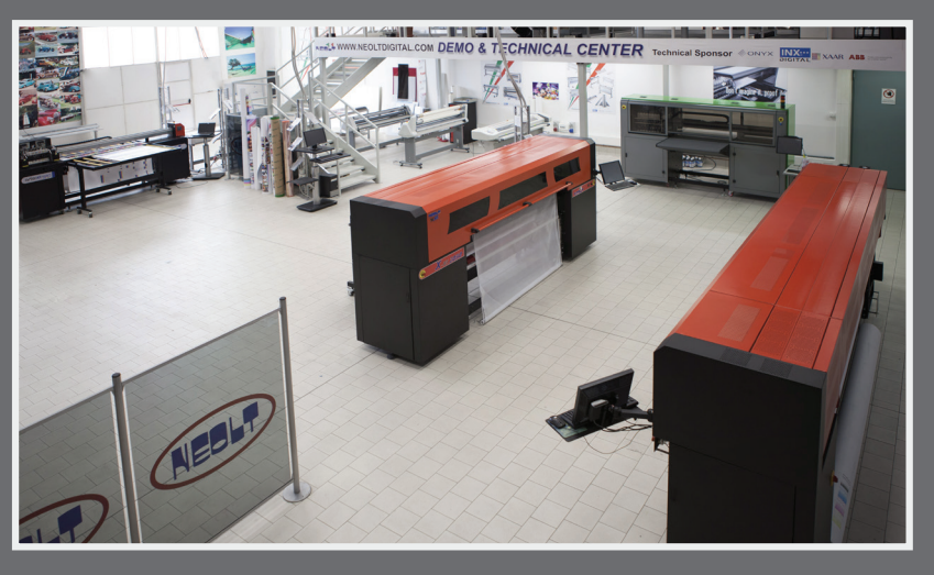
*You can ask for info and existing conditions when you fix an appointment for your visit. Subject to availability.